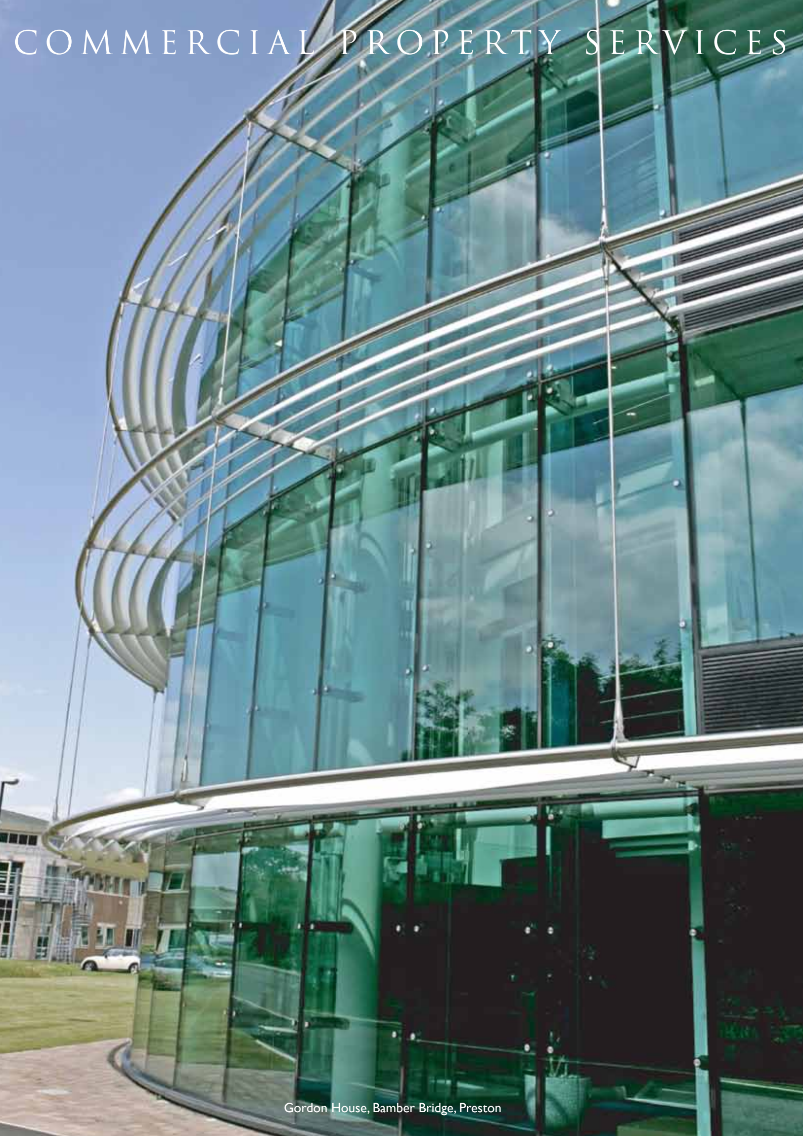
Gordon House, Bamber Bridge, Preston